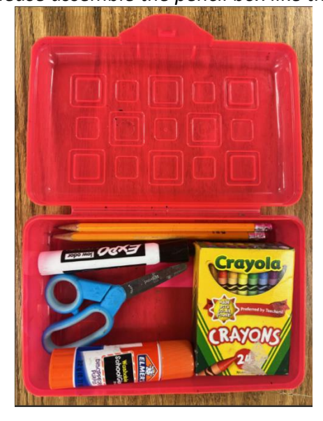
Please assemble the pencil box like this

All other supplies label with your name and put in a bag.